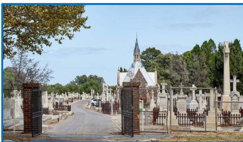
West Terrace Cemetery, Adelaide, SA.